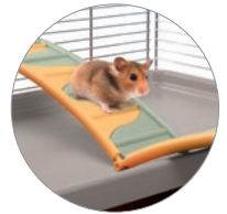
Tunnel Ø 5 cm